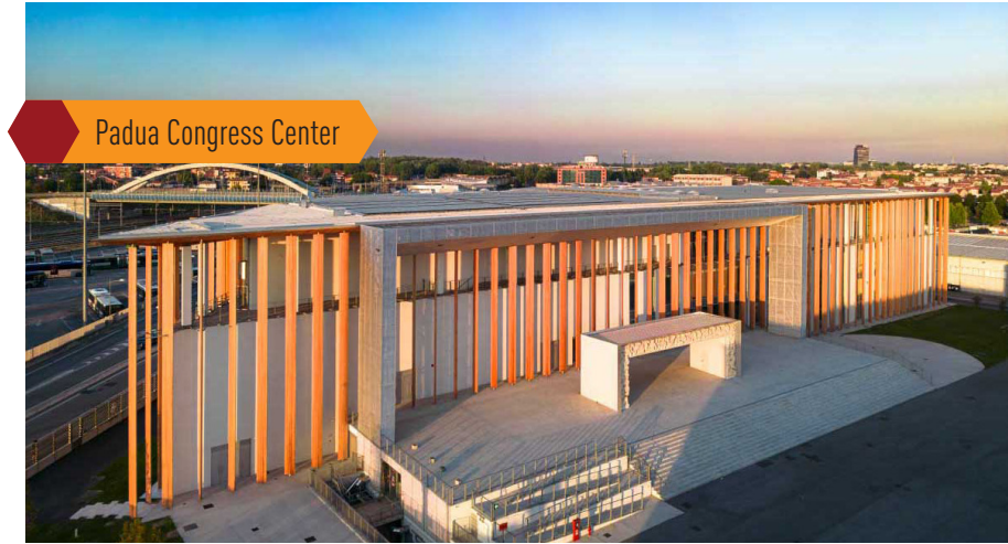
Padua Congress Center